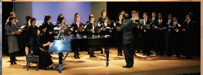
TOP: THE MEN'S GLEE CLUB OF NY BOTTOM: JAPAN CHORAL HARMONY

CO-SPONSORED BY THE TOKYO FOUNDATION AND THE WEATHERHEAD EAST ASIAN INSTITUTE AT COLUMBIA UNIVERSITY, WITH SUPPORT FROM THE DONALD KEENE CENTER OF JAPANESE CULTURE AT COLUMBIA UNIVERSITY, THE JAPANESE CHAMBER OF COMMERCE AND INDUSTRY OF NEW YORK, INC., THE NIPPON CLUB, THE JAPAN CHORAL HARMONY, AND THE MEN'S GLEE CLUB OF NEW YORK